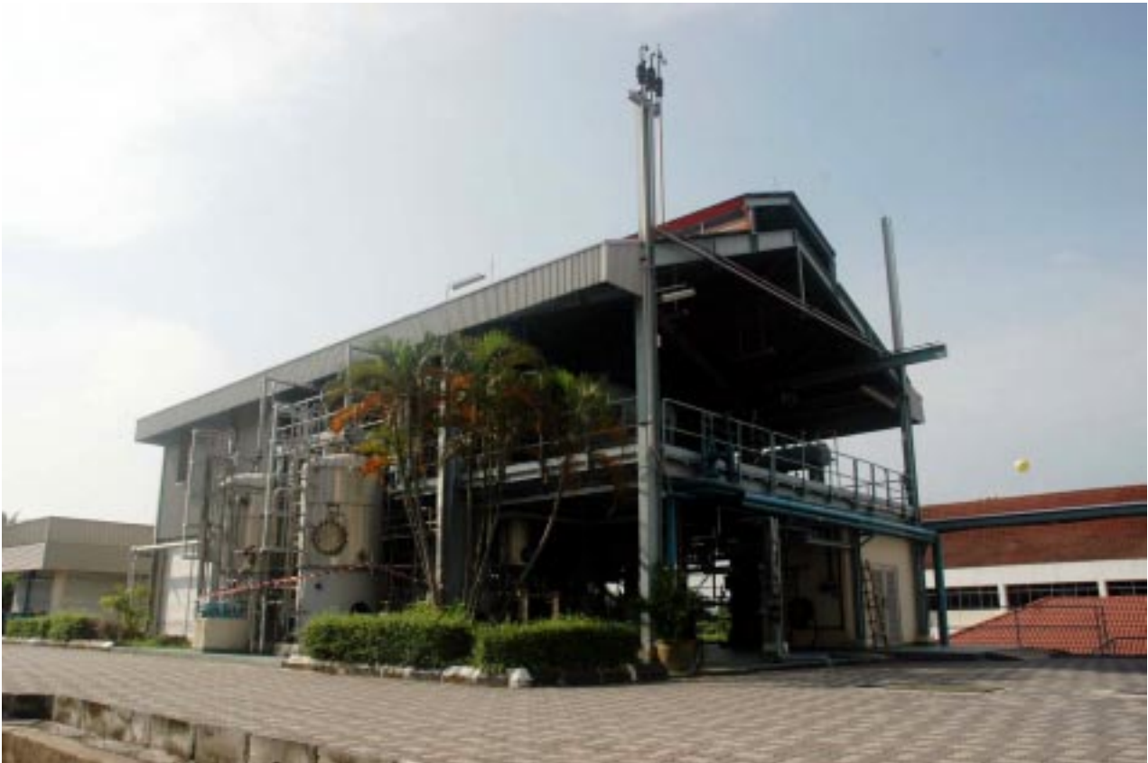
Figure 3. Palm Biodiesel Plant at the Malaysian Palm Oil Board (MPOB).