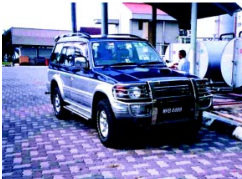
Figure 2. Vehicle Running on B5.