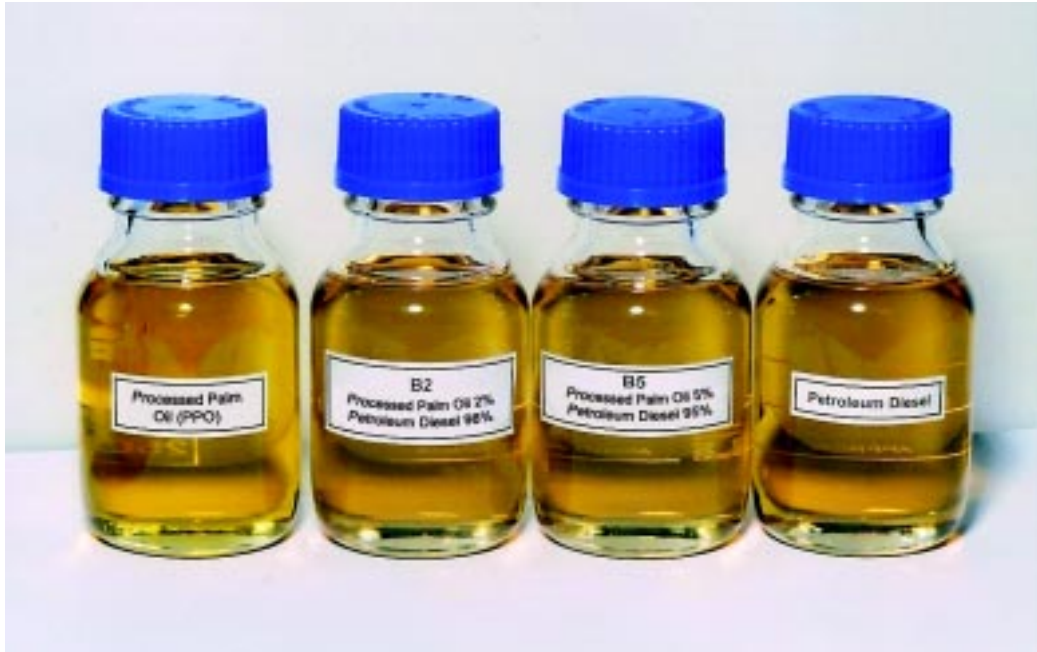
Figure 1. Various Biodiesel Blends.